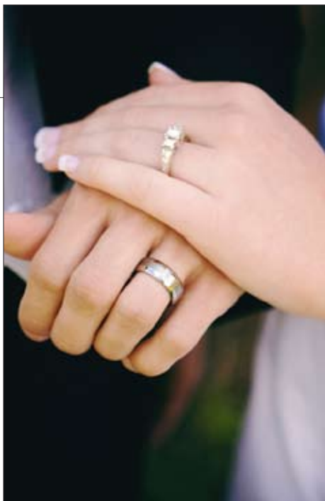
love of man and woman united in marriage. (Sacramentum Caritatis, 27)

The Eucharist, as the sacrament of charity, has a particular relationship with the