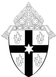
Diocese of Saginaw

Space is limited! Please register at least two weeks prior to a retreat or enrichment opportunity in order to avoid cancellations due to low enrollment.